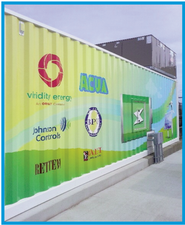
ACUA was awarded $300,00 by the NJ Board of Public Utilities (BPU) for development and construction of a battery storage project. ACUA and Viridity Energy partnered to install one megawatt of battery storage at the Authority's Wastewater Treatment Facility in Atlantic City.