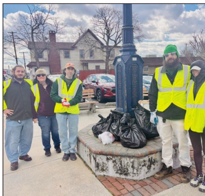
Absecon Green Team