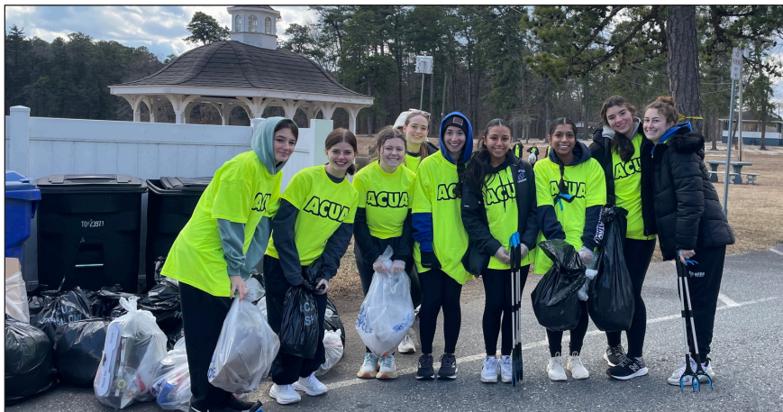
Hundreds participated in Hammonton's Community Cleanup in March

Spring is the perfect time to get involved in the Atlantic County Clean Communities Program! Community groups, families, businesses and schools can adopt county roads, school yards and parks to help keep our community clean. ACUA will provide supplies and safety gear. Visit acua.com/adoptaroad to learn more.