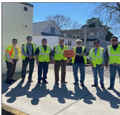
U.S. Submarine Veterans