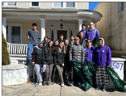
Egg Harbor City Coalition for a Safe Community