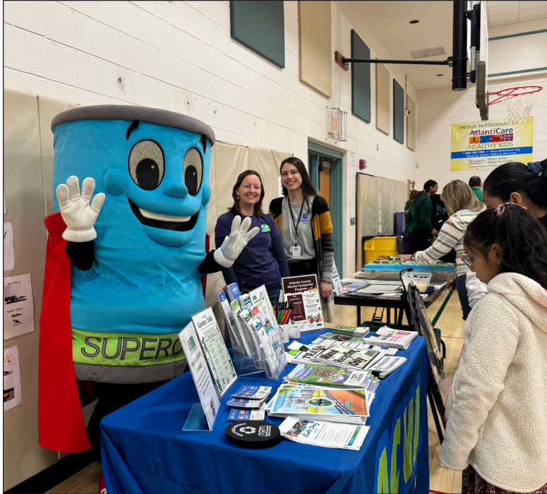
ACUA Attends Somers Point STEAM Night