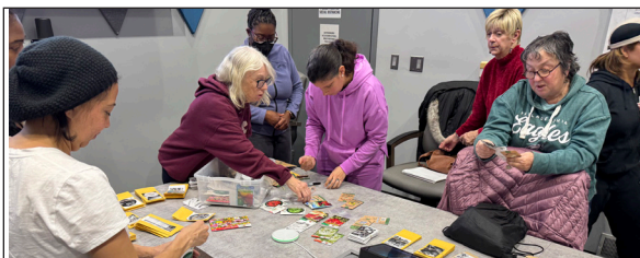
Attendees of ACUA's recent Garden Talk

4H Electronic Recycling Collection 8 AM to 12 PM David C. Wood 4H Center 3210 Route 50, Mays Landing ac4hfair.org/electronic-recycling