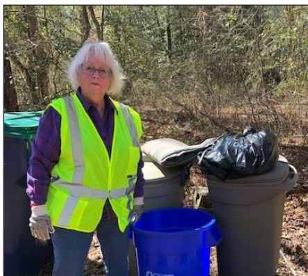
Corbin City Historical Society

Spring is the perfect time to get involved in the Atlantic County Clean Communities Program! Community groups, families, businesses and schools can adopt county roads, school yards and parks to help keep our community clean. ACUA will provide supplies and safety gear. Visit acua.com/adoptaroad to learn more.