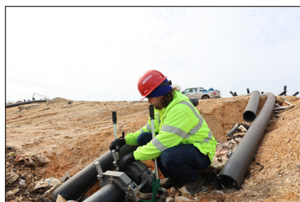
ACUA Landfill Systems Tech Tre L. works on gas collection pipes.

Residents can follow updates and subscribe to email alerts on notable landfill projects at acua.com/landfillgas .