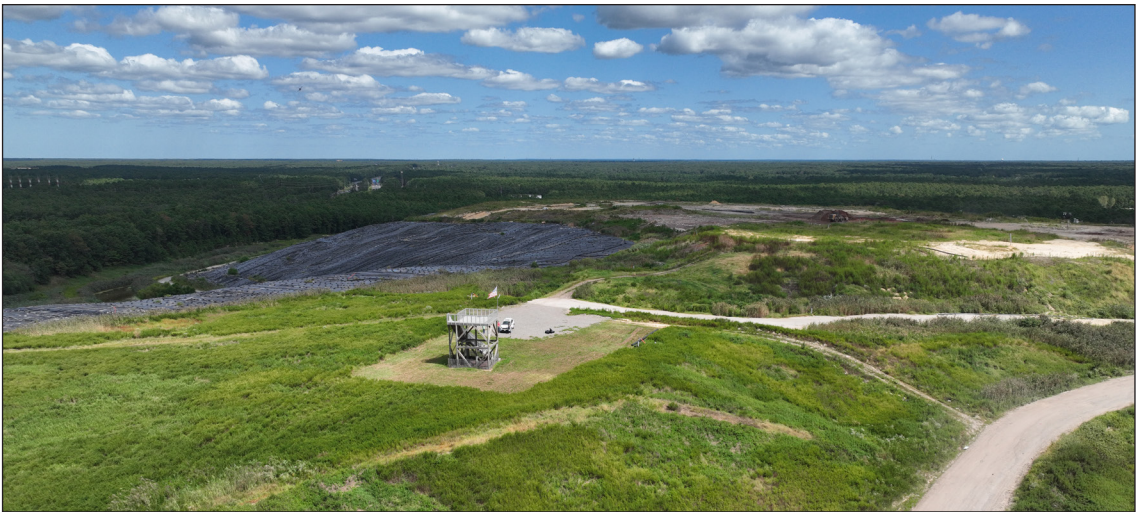
A permanently capped section of the ACUA landfill in Egg Harbor Township now grows green vegetation.