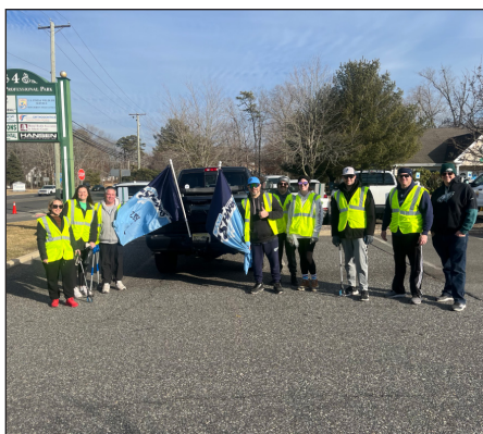
South Jersey Sand Sharks