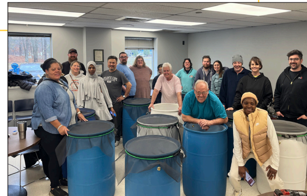
Participants show off their completed rain barrels after the recent workshop at ACUA.

Household Hazardous Waste Drop-Off 8 AM to 1 PM PM ACUA Environmental Park 6700 Delilah Road, Egg Harbor Township acua.com/hhw