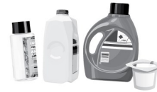
Plastics #1, #2, #5 Bottles/Containers/Jugs